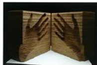
The Primitive Cube (Dr. Venetia Mui) 300 x 300 x 300mm - Plywood