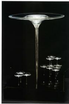
7 Cobay (Dr. Tan Loke Mun) 350 x 350 x 180mm - Acrylic, Plexiglas

The prestigious La Biennale di Venezia 2014 welcomed Malaysian artists and architects whose artwork is being showcased at the 141st International Architecture Exhibition. The festival will be open to public from 7 June – 23 November at the Arsenal, Venice. E2 speaks to the curatorial team.