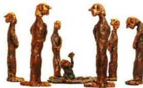
Who Should Help? (Ch'ng Huck Theng) 80 x 150mm - Bronze

Speaking on the participants' collection, Dr Lim says, 'This year's presentations are different from the previous years, simple because the participants are different. The collaboration between architects and artists is a natural one and more of this should be encouraged.'