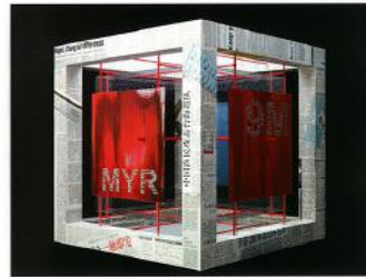
Between Sufficiency (Indra Ramonasthani) 500 x 500 x 500mm - Cardboard, Pepsico Newspaper