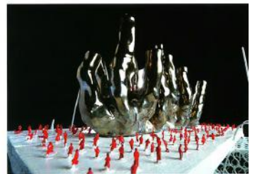
A Lesson from Ch'ng Asi (Guhani Faz20) 500 x 500 x 500mm - Acrylic

The Malaysian Pavilion illustrates the call for minimal by using suspended pet cages to display the artworks. 'The cages carry a story of sufficiency as they are recognized as 'suff'icient' habitat for various domesticated animals. They are light, easily portable and make little demands on transportation. When put together and suspended, they can become quite surreal,' explains Dr Lim who came up with the concept and design.