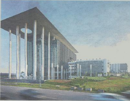
The impressive exterior of SP Setia's Corporate HQ building.