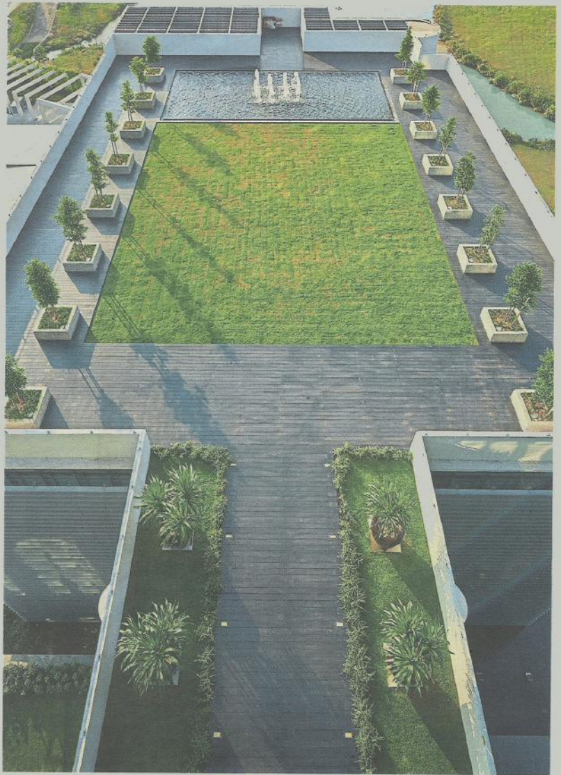
A view of the rooftop garden at SP Setia's Corporate HQ.

THE SP Setia Corporate HQ is an office tower conceptualised based on a need to provide a better and more sustainable work environment for Team Setia.