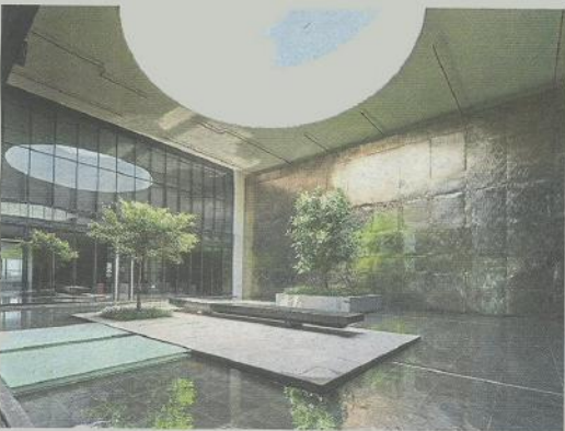
The SP Setia Corporate HQ's Level 8 open-air area.