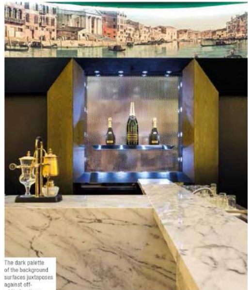
The dark palette of the background surfaces juxtaposes against off-white furniture and sleek white marble, softening the otherwise masculine foundation.